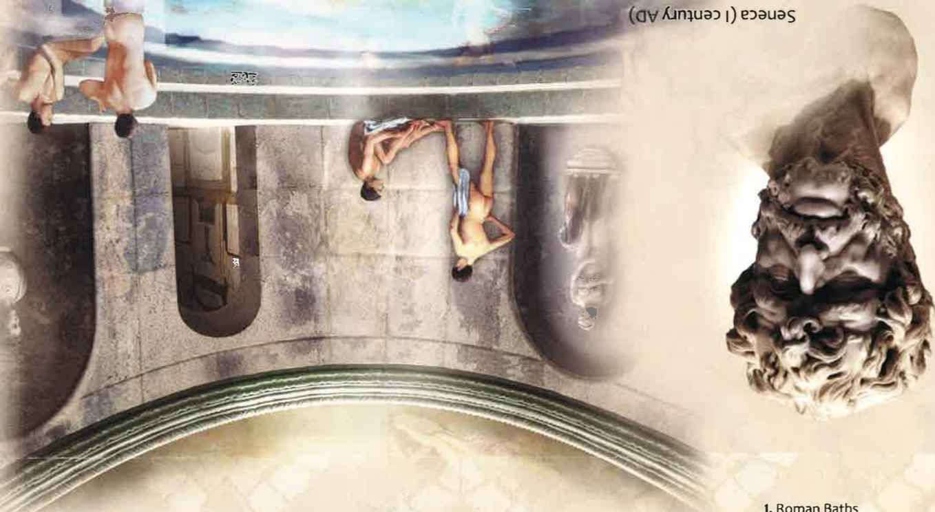
Seneca (1 century AD)

«I live near a public bathing house. When the stronger individuals are exercising ... I hear their roars ... add the arrest of a thief, and the one who always likes to hear his own voice in the bath, and those jumping into the pool with a huge bang...»